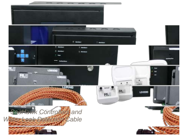
SeaHawk Controllers and Water Leak Detection Cable