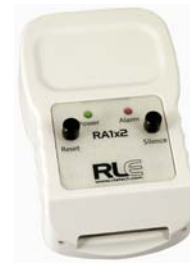
RA1x2 Alarm, Signal Splitter & Relay Replicator