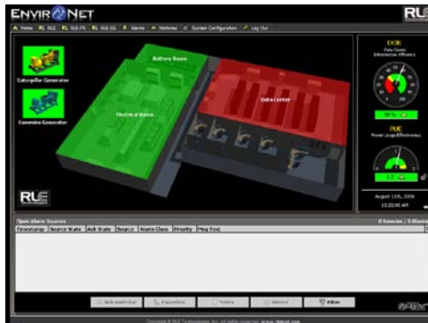
Environet Monitoring and Control System