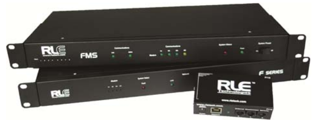
Falcon FMS, F1000/3400 & F110

Falcon products are stand-alone systems that can also be easily integrated into existing building management or network management systems.