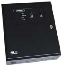
GFM 600 Ground Fault Monitor

Raptor integration and custom solutions include a comprehensive facility management system, services to design custom equipment, and standard products and sensors. Raptor products easily integrate into existing management and monitoring systems to provide enhanced visibility of critical equipment and environmental conditions.