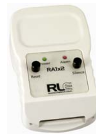
RA1x2 Alarm, Signal Splitter & Relay Replicator