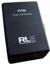
Power Fail Monitor